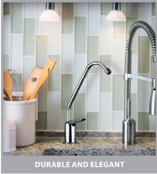
DURABLE AND ELEGANT